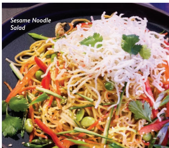
Sesame Noodle Salad

ADD avocado 6 | crispy tofu 6 | grilled chicken 8 grilled shrimp 9 | grilled Atlantic salmon 10