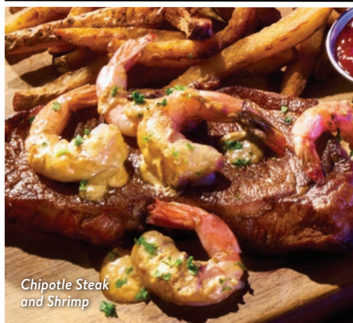
Chipotle Steak and Shrimp