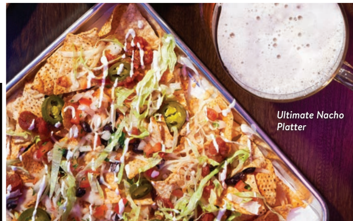
Ultimate Nacho Platter