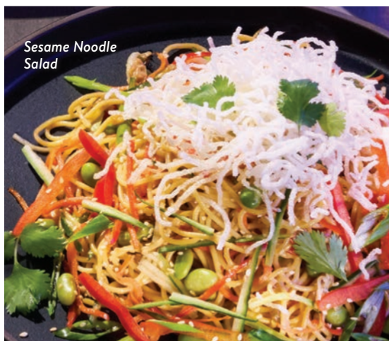
Sesame Noodle Salad

ADD avocado 6 | crispy tofu 6 | grilled chicken 8 grilled shrimp 9 | grilled Atlantic salmon 10