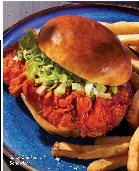
Spicy Chicken Sandwich

Delicious Impossible™ patty made from plants, onions, pickles, lettuce, The Rec Room sauce, toasted potato bun 21