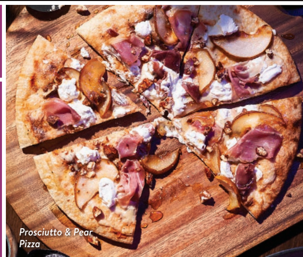
Prosciutto & Pear Pizza

Roasted mushrooms, goat cheese, caramelized onions, cream sauce, chives, cracked chilis 17