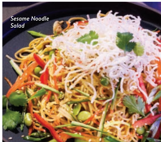
Sesame Noodle Salad

grilled shrimp 9 | grilled Atlantic salmon 12