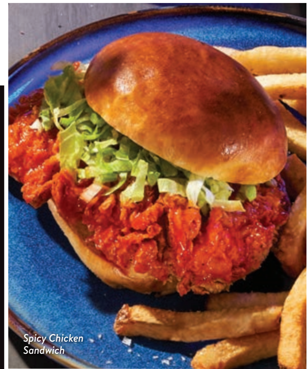
Spicy Chicken Sandwich

Delicious Impossible™ patty made from plants, onions, pickles, lettuce, The Rec Room sauce, toasted potato bun 21