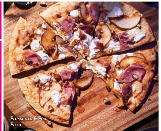
Prosciutto & Pear Pizza

Roasted mushrooms, goat cheese, caramelized onions, cream sauce, chives, cracked chilis 18.5