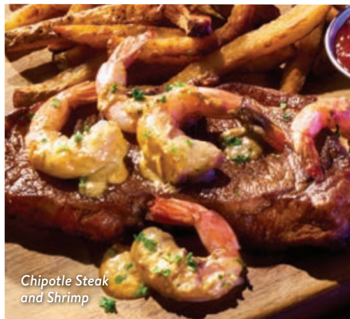
Chipotle Steak and Shrimp

8 oz. AAA flat iron steak, shrimp, chipotle butter, house-cut fries 38 UPGRADE to 10 oz. AAA New York striploin 10