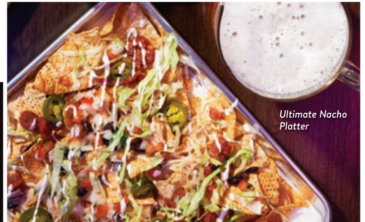
Ultimate Nacho Platter