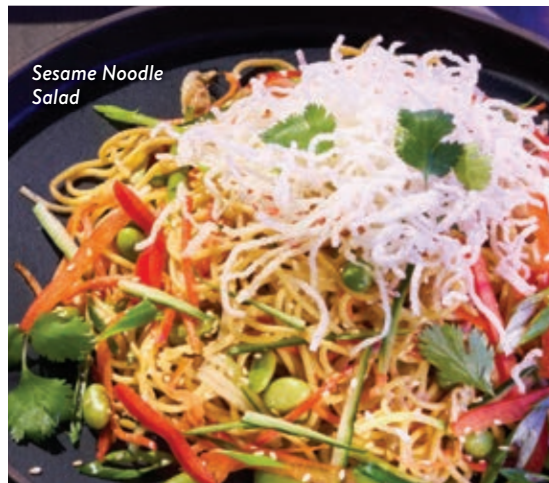
Sesame Noodle Salad

grilled shrimp 9 | grilled Atlantic salmon 12