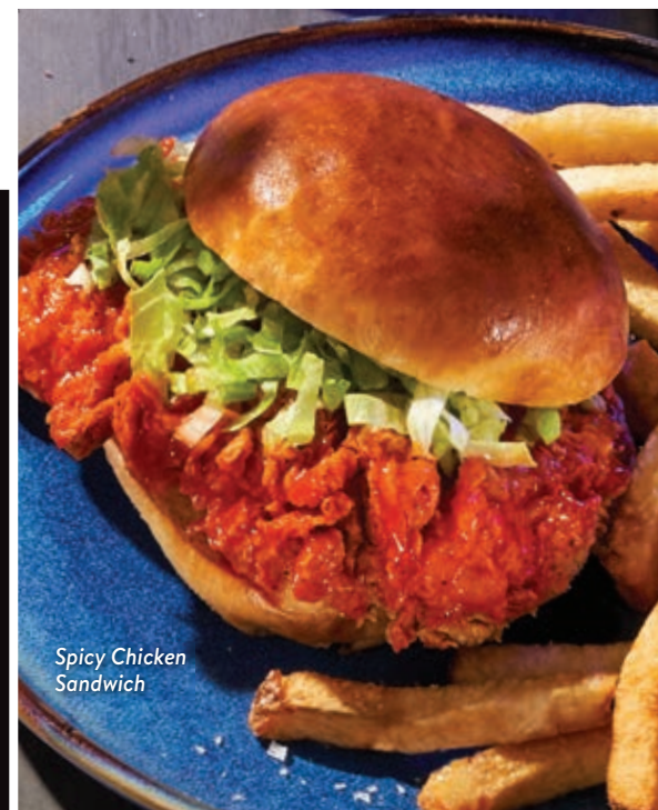
Spicy Chicken Sandwich

Delicious Impossible™ patty made from plants, onions, pickles, lettuce, The Rec Room sauce, toasted potato bun 21