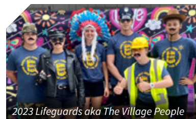
2023 Lifeguards aka The Village People

If you were not able to attend, it isn't too late to support this amazing place. A gift today helps another child experience the true joy of summer fun. Supporters and donors like you help fund camp expenses, including food, supplies, upgrades and equipment. But there are many other ways you can support Boys Town, including sharing your time, talent and treasure. To learn more, please reach out to melissa.steffes@boystown.org