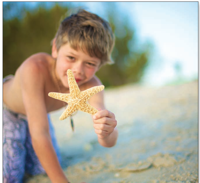
Beach combing on Gulf Coast Naples, Florida