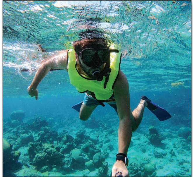
Snorkeling in the Caribbean Celebrity Apex Cruise