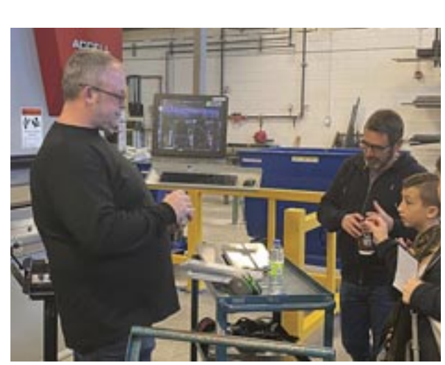
Visitors at the LMAC Career Centre auto shop.

Laurier Macdonald Career Centre held an Open House and barbeque at their Des Grandes Prairies Campus last fall. Both old-fashioned and newer car models, offered by teachers, industry partners and local collectors, were on display around the school grounds. One of the cars opened up into a barbecue, offering guests sausage sandwiches and pizza free of charge. Prior to enjoying the cars, all visitors were invited inside to tour the spacious des Grand-Prairies campus, which is home to the vocational centre's Automobile Mechanics, Welding & Fitting, and Mechanics of Electric Vehicles programs. Representatives from the school's Aesthetics, Hair Removal and Hairdressing programs, offered out of the Centre's Jean Talon campus, were also on hand.