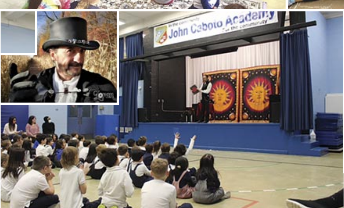
Les taux de réussite de la CSEM en lien avec le programme du ministère de l'Éducation suggèrent que ses élèves sont bien préparés à suivre le programme Français.

et des organismes inscrits au Répertoire du patrimoine culturel du Québec. C'est une façon d'appliquer ce qui est enseigné à l'école avec l'expérience réelle d'artistes dans le domaine.