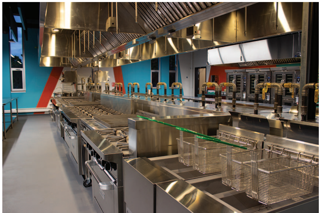
A look at one of the new kitchens.