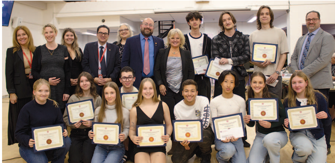
À la lumière des données de l'année scolaire 2024-2025, 13 élèves de 4 e secondaire et 2 élèves de 5 e secondaire ont été honorés pour avoir obtenu la note de 100 %.

Au total, on compte 6 élèves du Collège Vincent Massey à Rosemont, 4 élèves de l'Académie Royal West à Montréal-Ouest, 3 élèves de l'école secondaire M.I.N.D. sur Le Plateau et 2 élèves de l'Académie internationale Marymount à NDG.