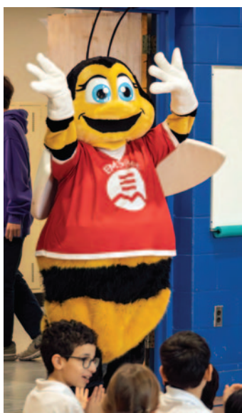
EMSB mascot Bumble was on hand much to the delight of students.

and the EMSB’s social media platforms. The celebration began with a lively school assembly showcasing musical and dance performances by Cedarcrest students. Students and staff from nearby schools – Parkdale and Gardenview in Saint-Laurent, as well as Carlyle School in Town of Mount Royal – were also in attendance.