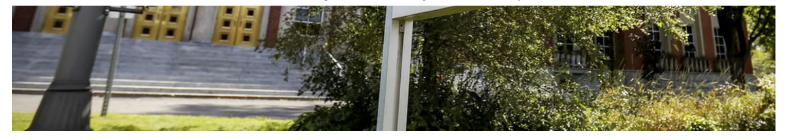
The English Montreal School Board offices in Montreal.

The English Montreal School Board says an independent financial review it ordered in 2017 to track what was thought to be millions of dollars in missing international student tuition fees turned up nothing nefarious and raised no red flags.