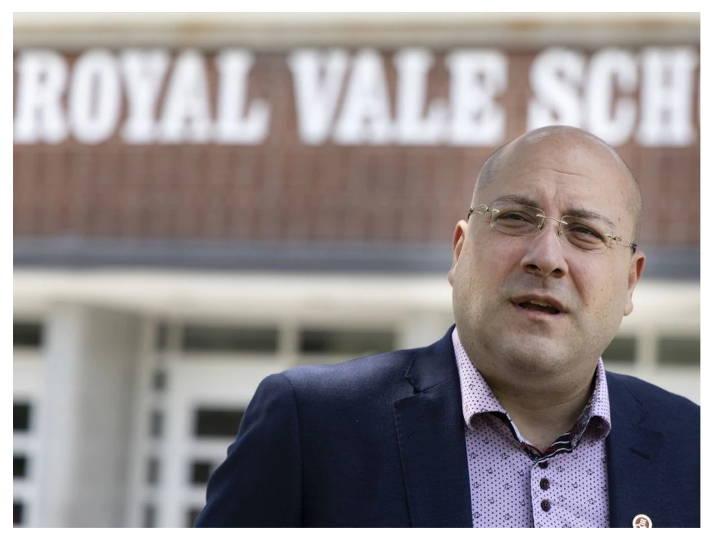
Premier François Legault "seems willing to do anything to deflect attention from legitimate opposition to his proposed