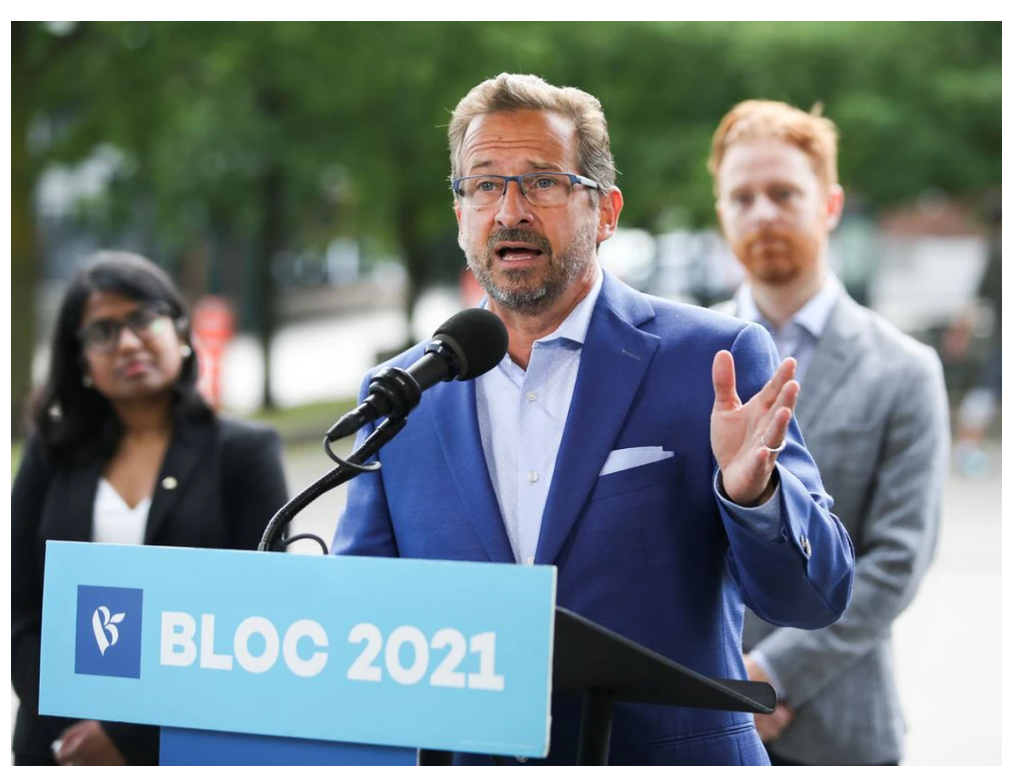
Bloc Québécois Leader Yves-François Blanchet, seen in a file photo, said the EMSB document is an "insult."

This advertisement has not loaded yet, but your article continues below.