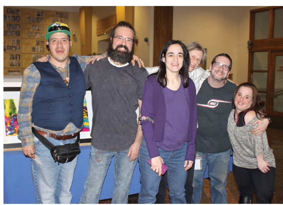
Students and staff celebrate together at the vernissage at the YM-YWHA.