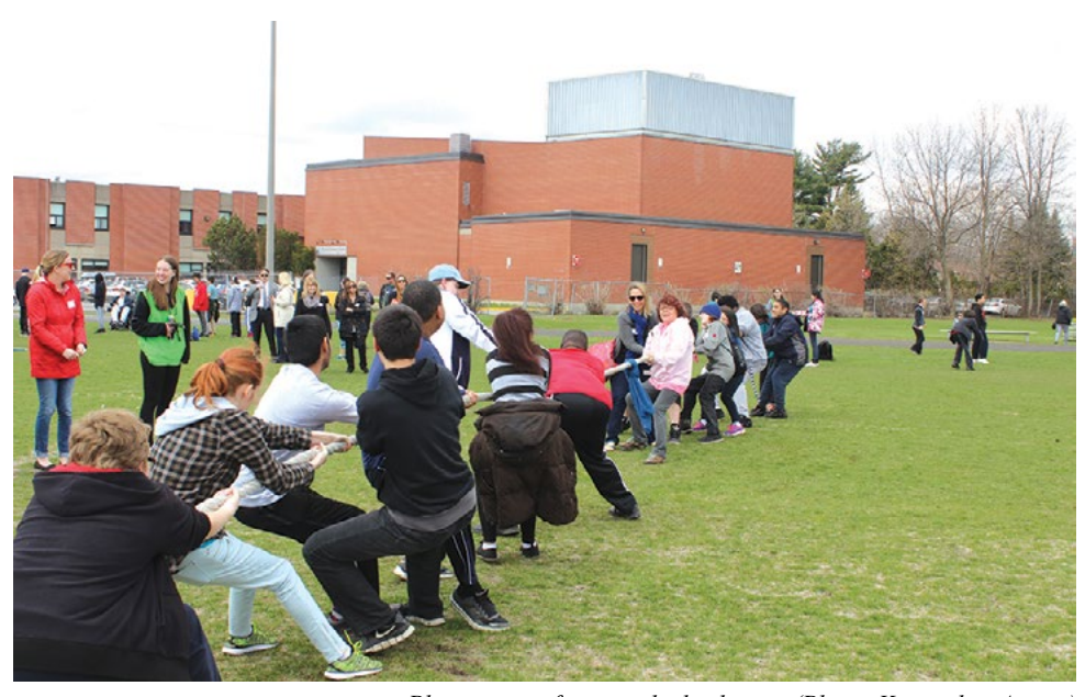
Playing tug-of-war at the barbecue.