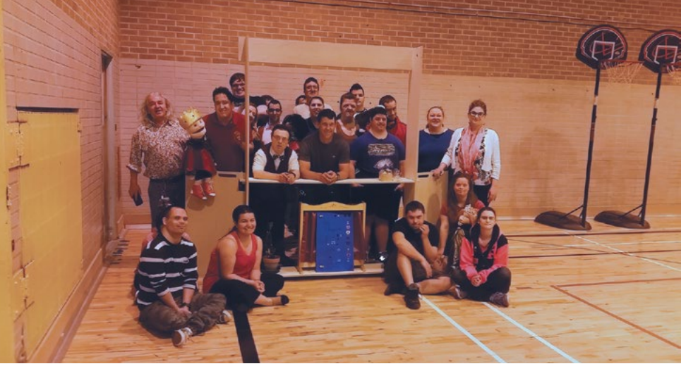
Galileo SIS students show off their new portable puppet show stage.