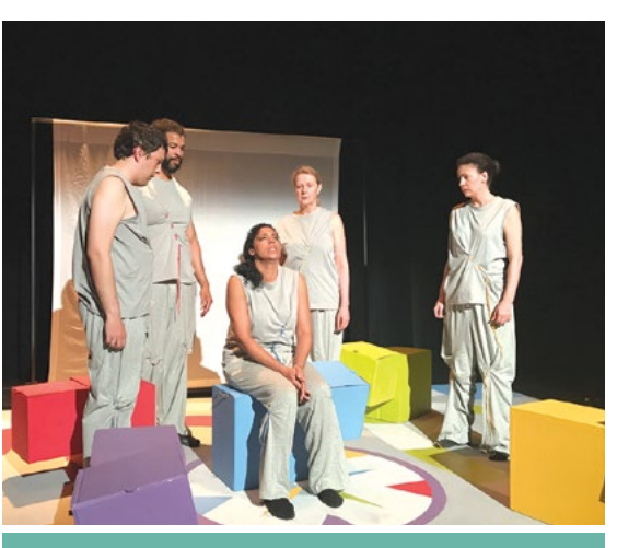
The cast of The Autism Monologues.

The cast of five actors do a wonderful job in taking the audience on the journey with them. Most commendable are the portrayals of individuals with autism – from a nonverbal child, to a likable teen with