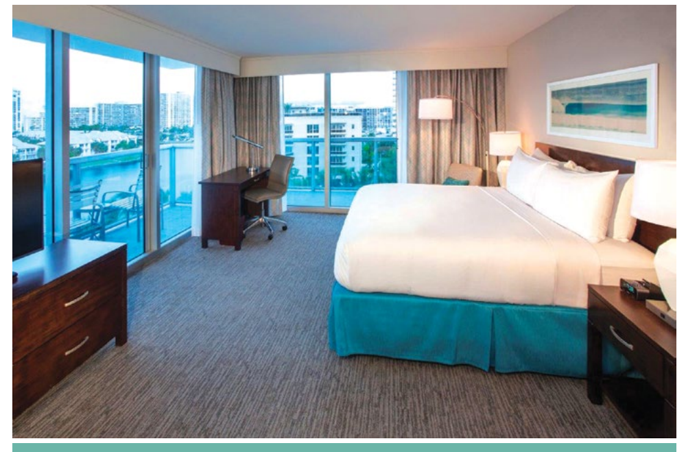
A corner king room.

Guests will find American cuisine with Caribbean flair across the resort's restaurant and bars. Its lobby nook, Made Market, offers Starbucks coffee, ice cream, snacks, and more. Port South Bar and Grill is open for breakfast, lunch and dinner, featuring