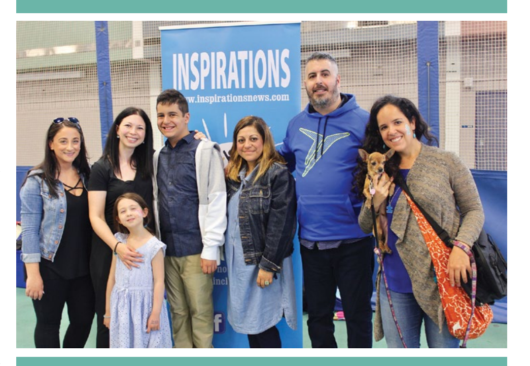
Part of Team Inspirations EMSB at the Autism Speaks Canada Montreal walk.