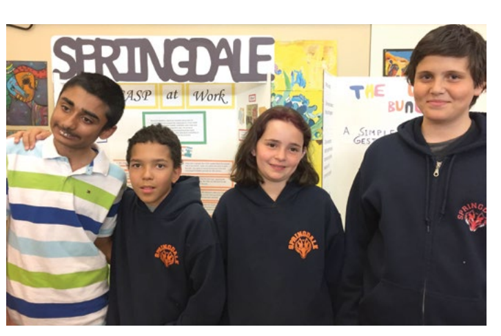
Springdale students at the LBPSB entrepreneurial gala.

Springdale's second initiative was "The Lunch Bunch", where students tried to make lunch hour more peaceful and engaging by encouraging harmony amongst the students.