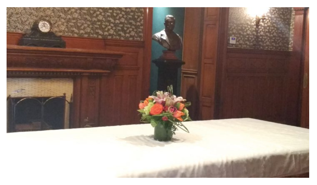
A beautiful arrangement made by students at Summit Tecc Flora.