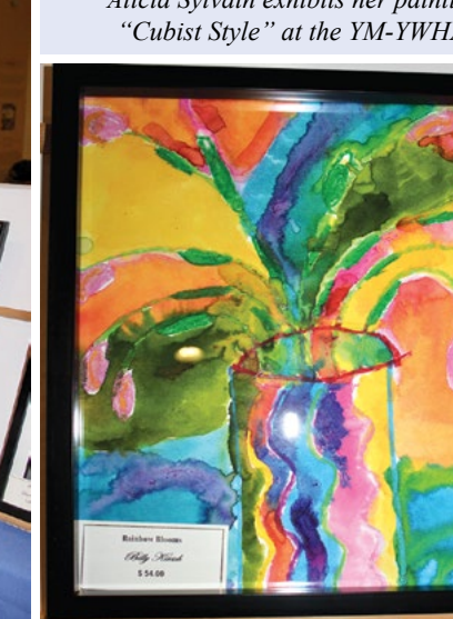
"Rainbow Blooms" by Billy Kirsch.