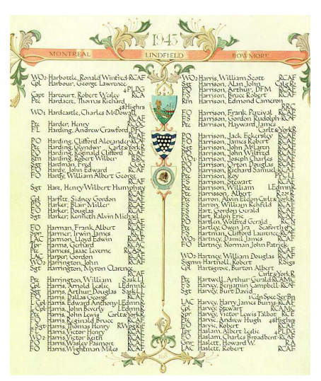
Page 168 of World War Two book