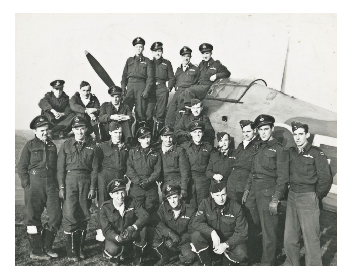
^ Group photo of Squadron 438 (RCAF)