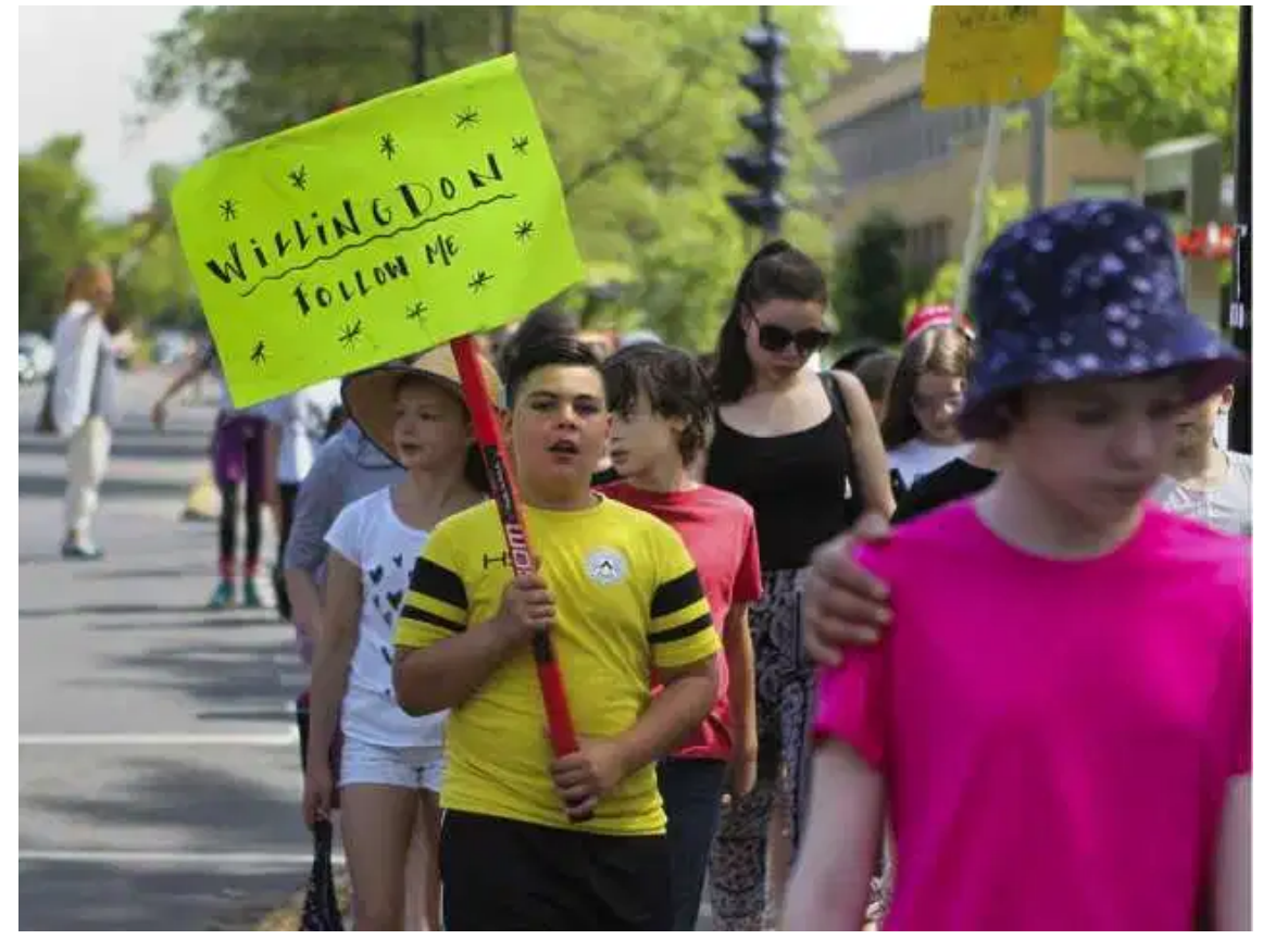
Grade 5 and 6 students from Willingdon Elementary School walk from their school with teachers and parents, to a senior campus about 2 kilometres away that is being prepared for them on Wednesday, June 19, 2019 as a solution to increased enrolment.

NDG elementary school preps for expansion in response to overcrowding | Montreal Gazette