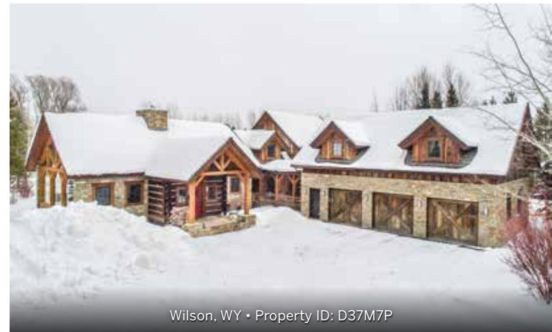
Wilson, WY • Property ID: D37M7P