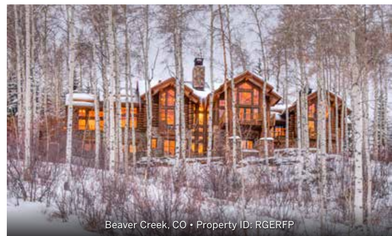
Beaver Creek, CO • Property ID: RGERFP