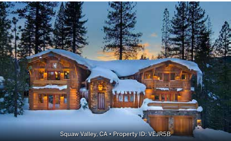
Squaw Valley, CA • Property ID: VEJR5B