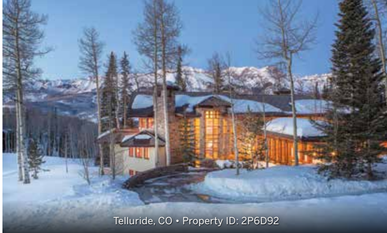
Telluride, CO • Property ID: 2P6D92