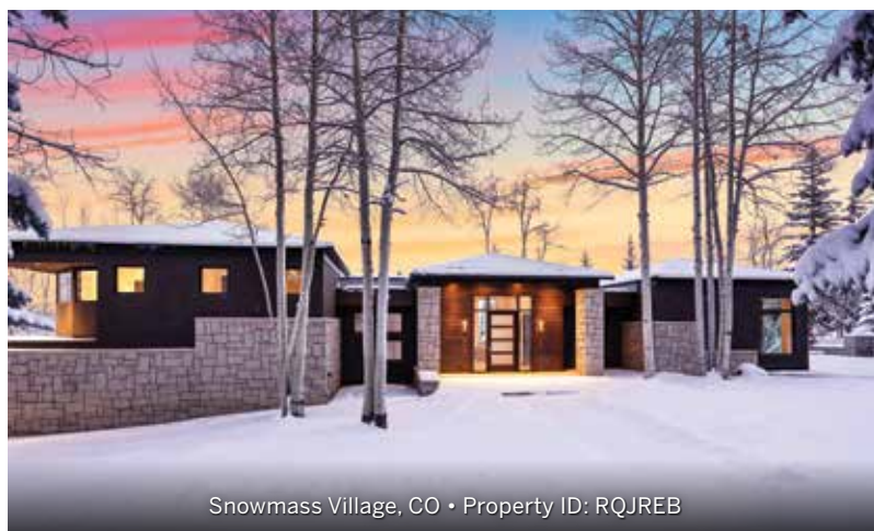
Snowmass Village, CO • Property ID: RQJREB