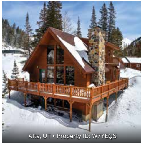
Alta, UT • Property ID: W7YEQS