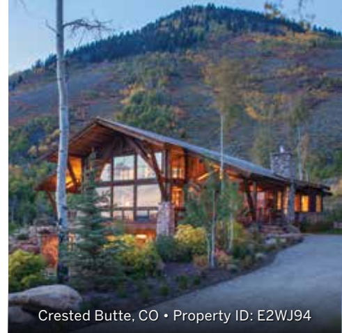
Crested Butte, CO • Property ID: E2WJ94