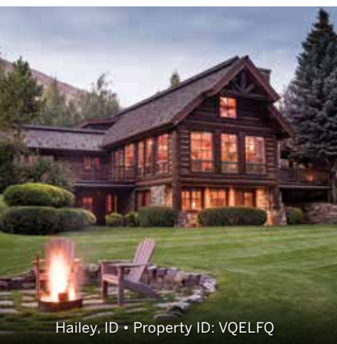
Hailey, ID • Property ID: VQELFQ