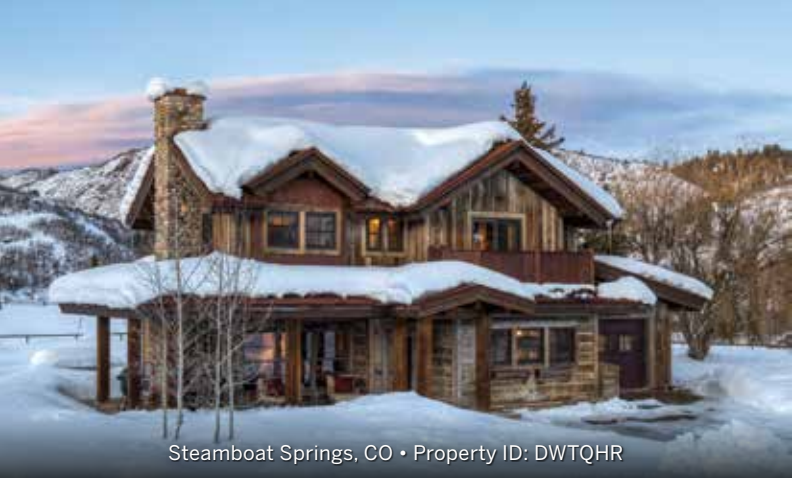
Steamboat Springs, CO • Property ID: DWTQHR