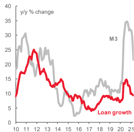
Peru: M3 vs. Loan Growth