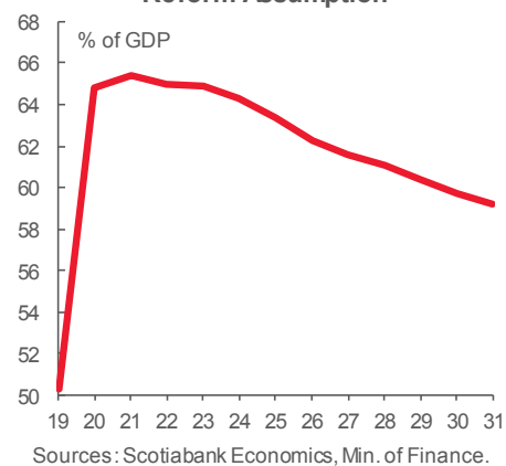
Colombia: Central Government Gross Debt Ratio Under Fiscal Reform Assumption