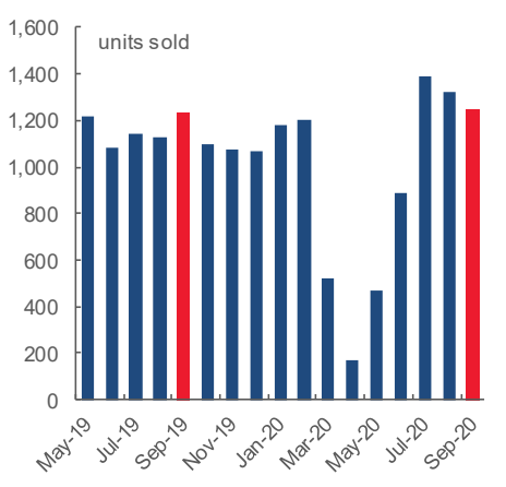
Peru: Lima Home Sales